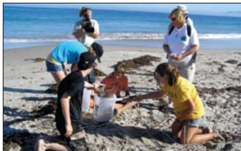
Last year's ninth grade class sifts sand to study the amount and types of debris and trash found on Santa Rosa Island.

begins the year with our exciting two-week Channel Islands Seminar examining various historical, environmental, and economic issues related to the islands and our local resources. Students will hone their research skills, test their conclusions in the field, and present their findings through oral reports and formal research papers. For more information, please feel free to browse our World History Wiki from last year at: sbmsworldhistory.wetpaint.com