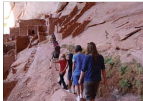
Eighth graders at Betatkin in Navajo National Monument in June 2009.

Foxen Canyon and Sisquoc to Camino Cielo and Refugio Pass. Students learned much about their own region, from sea level to 4,000 feet, on this journey appropriately named, "No Place Like Home."