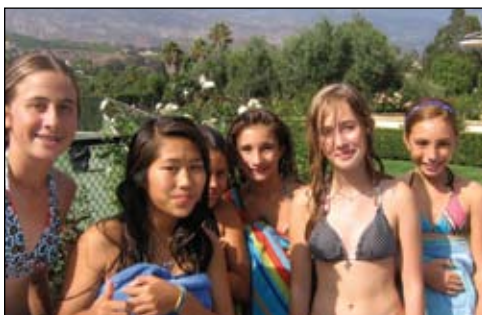
New friends were made at the New Family Welcome Party in August.